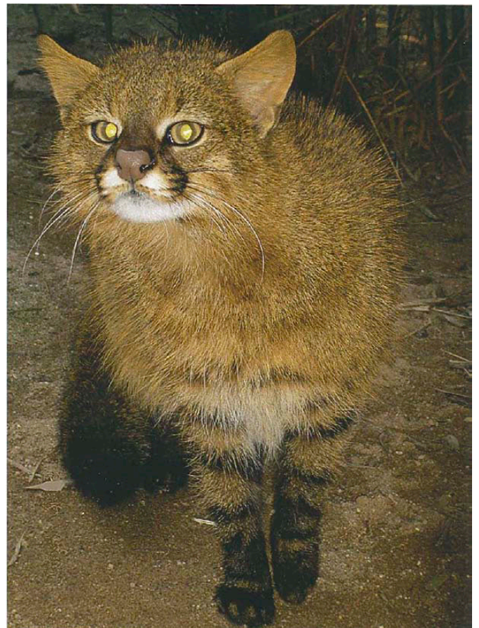
→ Fig. 1. — Leopardus braccatus munoai exhibited as gato palheiro (= Leopardus colocolo ) at Zoológico del São Paulo.

Oncifelis Severtzov, 1858:386. Type species Felis geoffroyi d’Orbigny and Gervais, 1844, by monotypy; proposed as a subgenus of Felis Linnaeus, 1758.